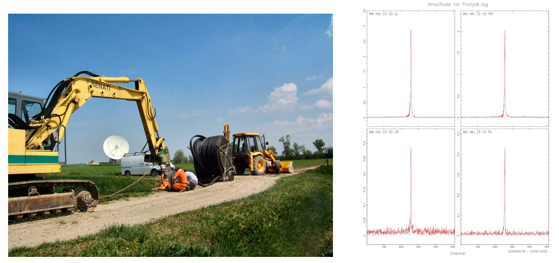
Figure 3: Left: Last-mile fiber works at the 32-meter radiotelescope in Medicina (Italy). Right: First real-time interference fringes (Mc-Wb).