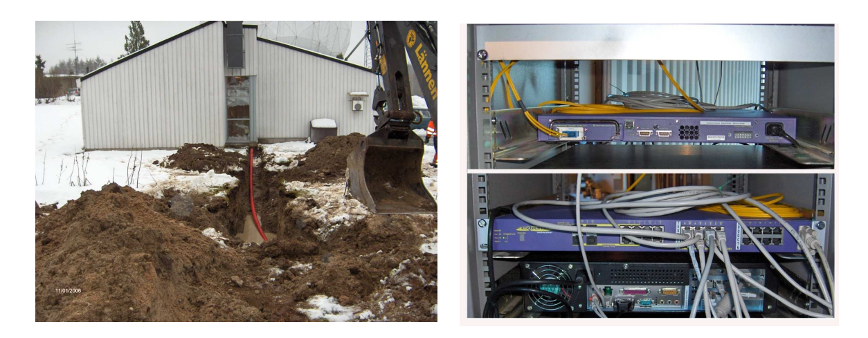
Figure 2: Last-mile fiber works (left) and equipment (right) at the 14-meter radiotelescope in Metsähovi (Finland).