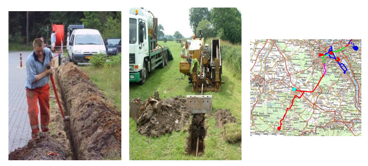
Figure 4: Last-mile works at Westerbork (left), Jodrell Bank (center), and future line to Effelsberg (right).

Figure 3: Left: Last-mile fiber works at the 32-meter radiotelescope in Medicina (Italy). Right: First real-time interference fringes (Mc-Wb).