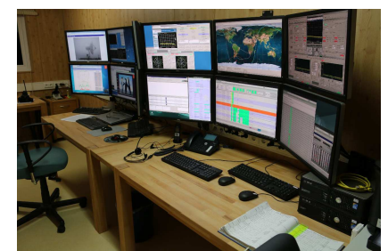
New combined satellite tracking and VLBI control room

This extends the possibilities for VLBI-observations.