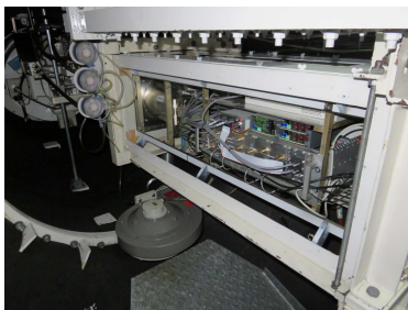
New S-/X-Band VLBI Receiver at O'Higgins

The monitoring of the VLBI receiver is Ethernet-based. This gives more flexibility for remote control and supervision from Wettzell.