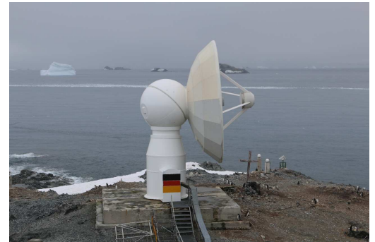
9 m radiotelescope O'Higgins